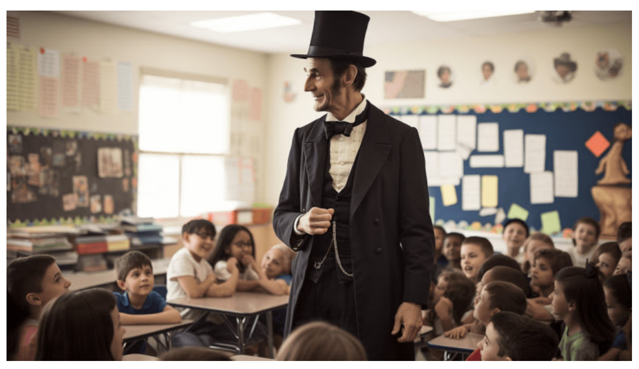
Al image generated using Midjourney

What if a historical character you're studying -- like Abraham Lincoln -- could visit your class and interact with students?